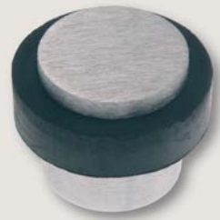
229 Floor Mounted Door Stop SA APDS229SA