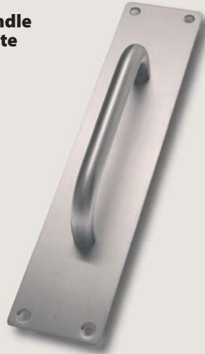
Pull Handle on Plate