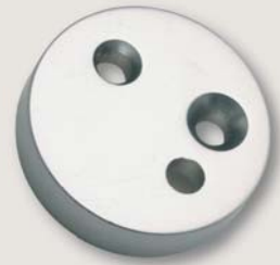
29S Floor Door Stop Spacer SCP APDSS29SCP 29S Floor Door Stop Spacer CP APDSS29CP