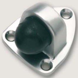
250 Floor Mounted Door Stop SCP APDS250SCP 250 Floor Mounted Door Stop CP APDS250CP