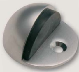
29 Floor Mounted Door Stop SCP APDS29SCP 29 Floor Mounted Door Stop CP APDS29CP