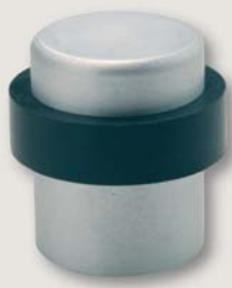
228 Floor Mounted Door Stop SSS APDS228SSS 228 Floor Mounted Door Stop PSS APDS228PSS