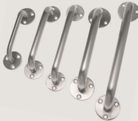
Pull Handle on Rose